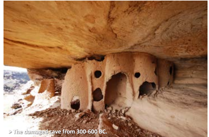
> The damaged cave from 300-600 BC.

SDO made a plan of the work and made a complete documentation, on the basis of which the restoration can be executed.