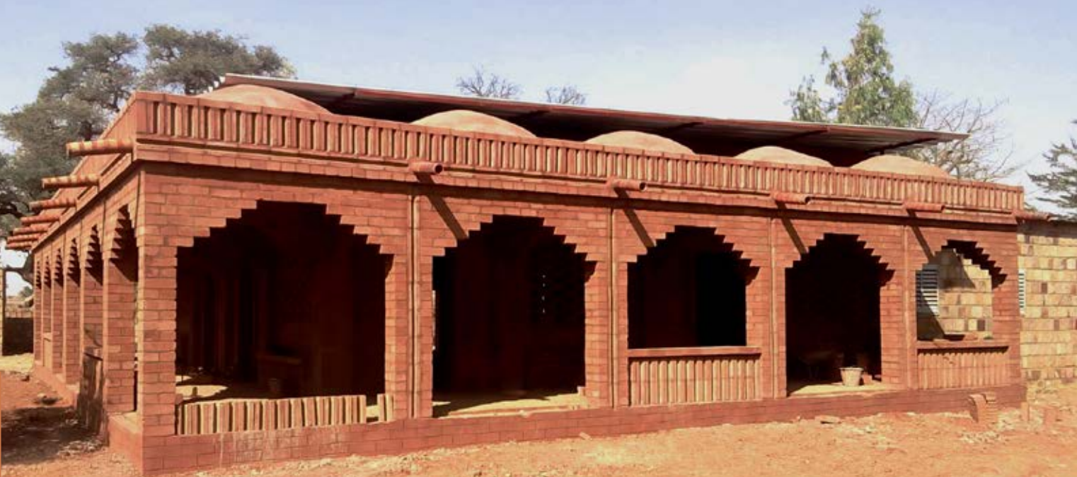
> Extension of town hall in Sangha with meetings space and verandas all around.