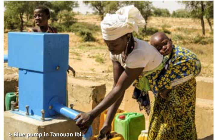
> Blue pump in Tanouan Ibi.

Three pumps are placed in 2015: in Tanouan Ibi, Koundou and Sogu Yaguem.