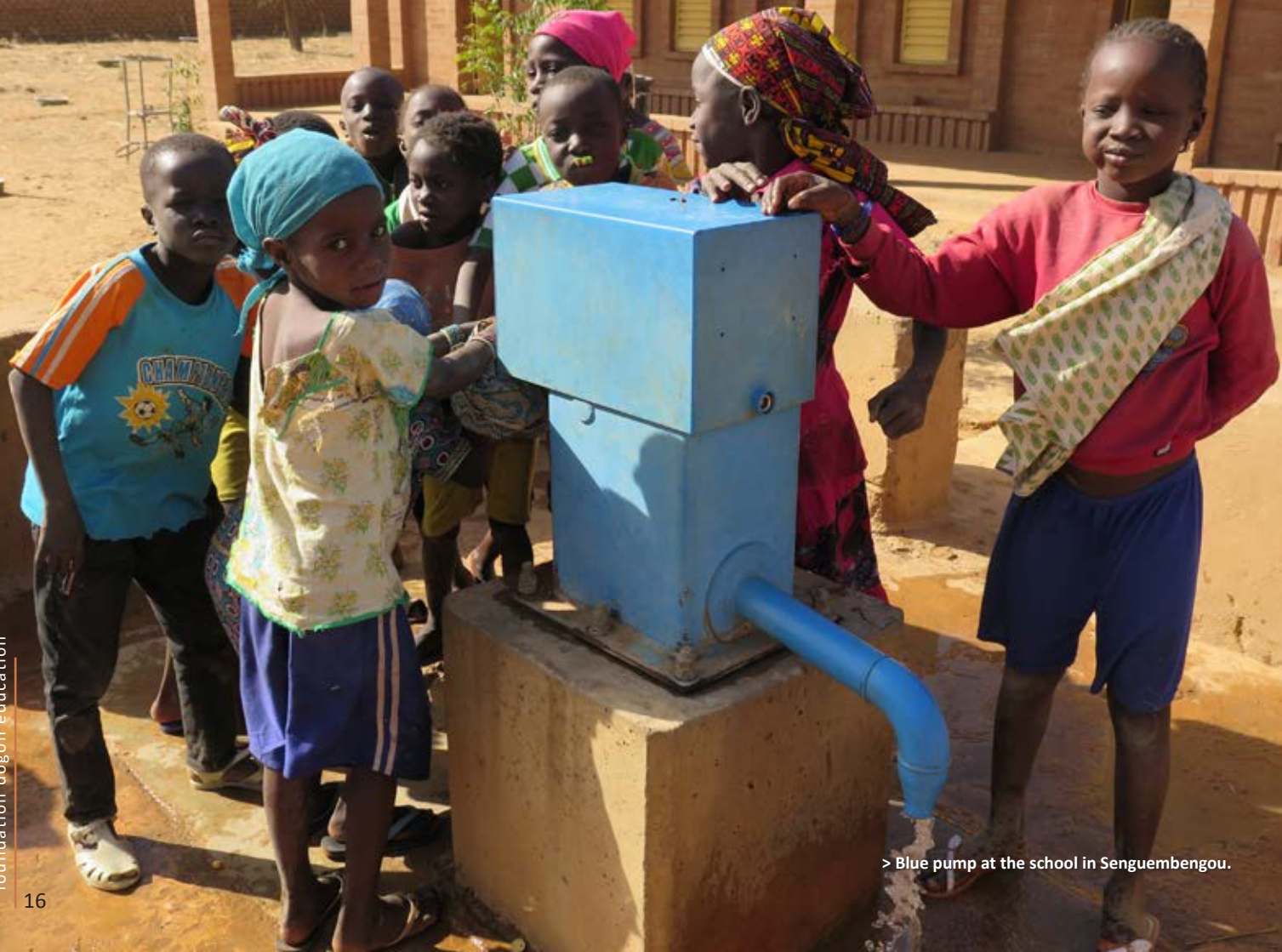
> Blue pump at the school in Senguembengou.