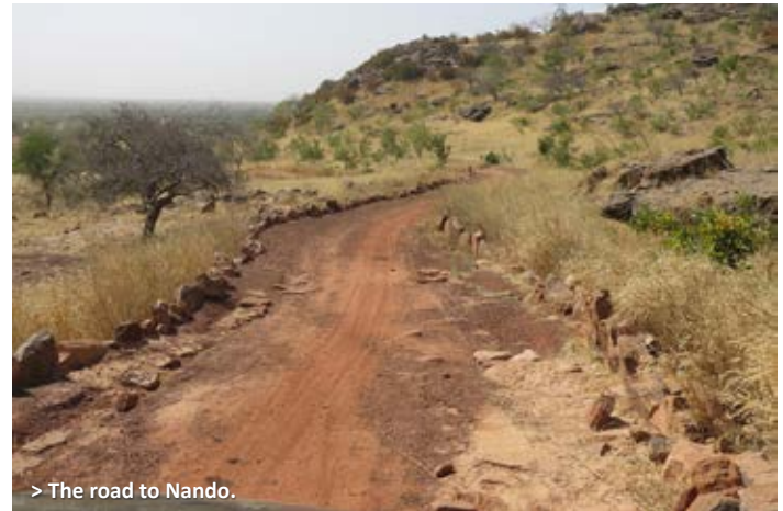
> The road to Nando.