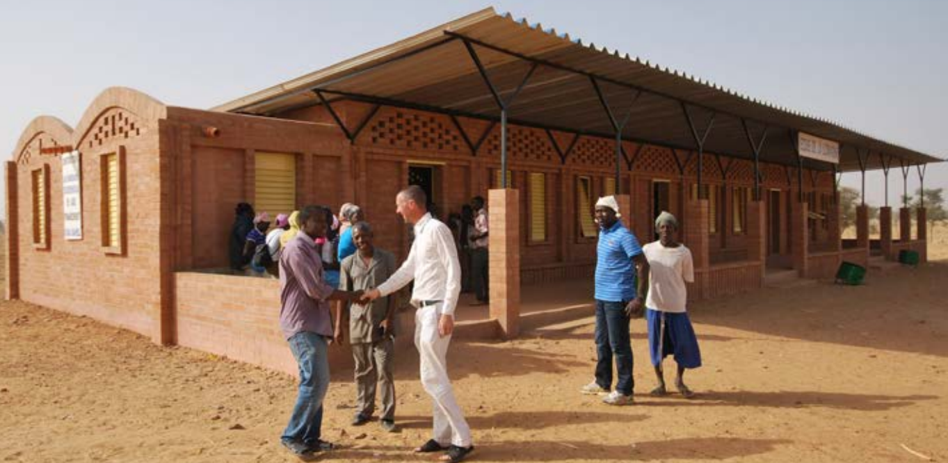
> The satisfied school principal in Ogoudengou.