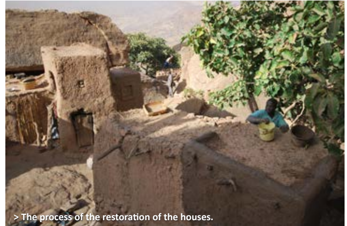
> The process of the restoration of the houses.

In 2015 in Nando the road and the water well have been improved. In order to make possible the restoration of three family houses, the road had to be improved. This had already been financed in 2014, when the work started. In 2015 thirty men were working on the project and it has been completed. In Nando the restoration of three family houses has begun. This work and the improvements of the water situation ask for considerable attention. This will be continued in 2016.