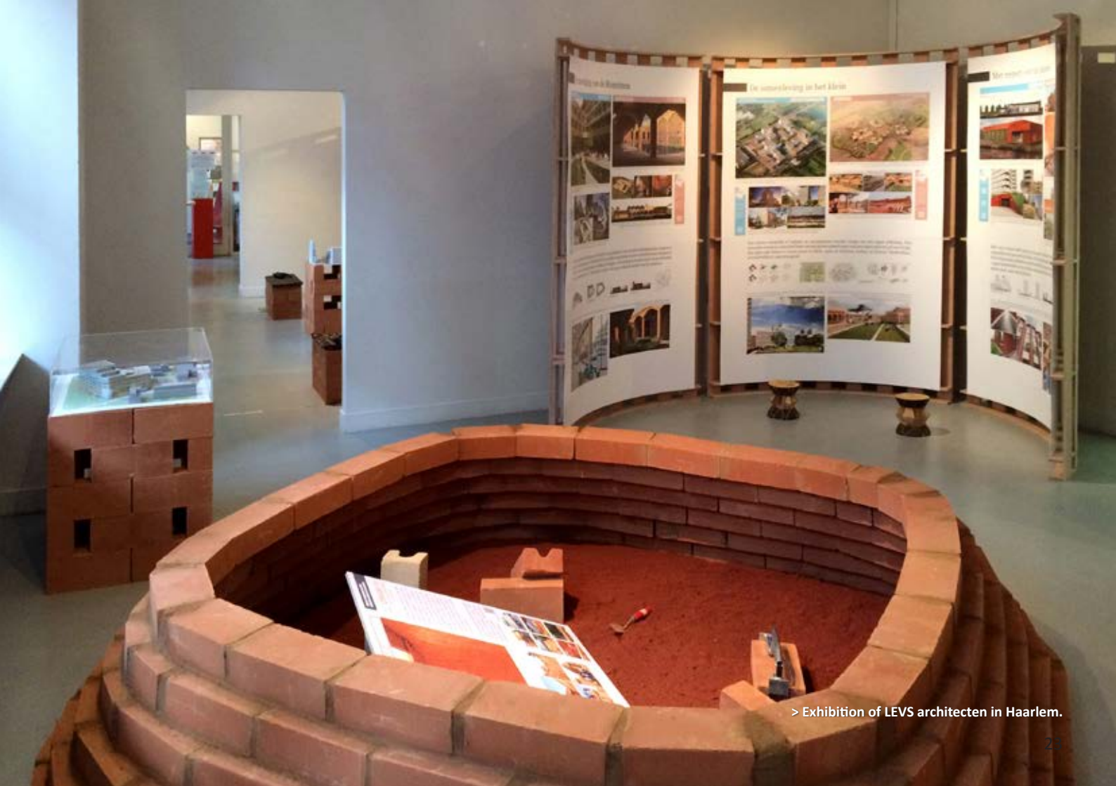
> Exhibition of LEVS architecten in Haarlem.