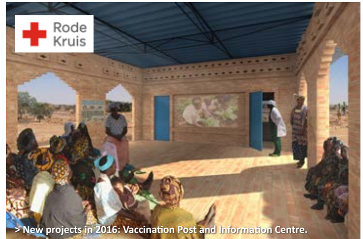
> New projects in 2016: Vaccination Post and Information Centre.