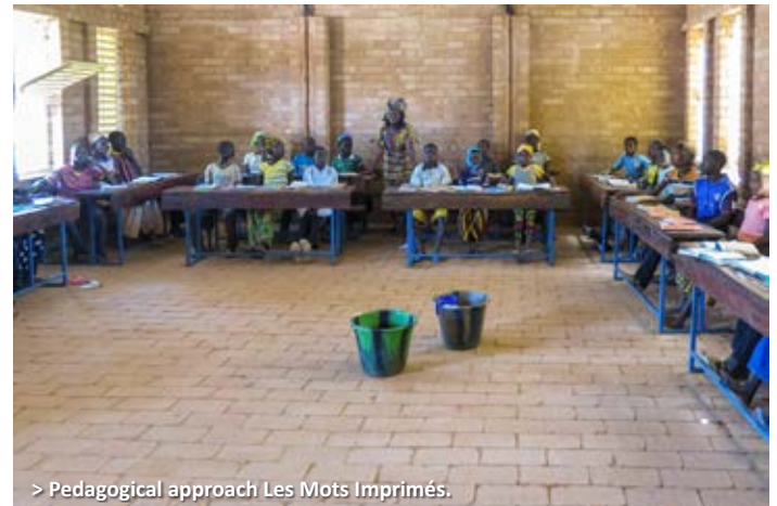
> Pedagogical approach Les Mots Imprimés.