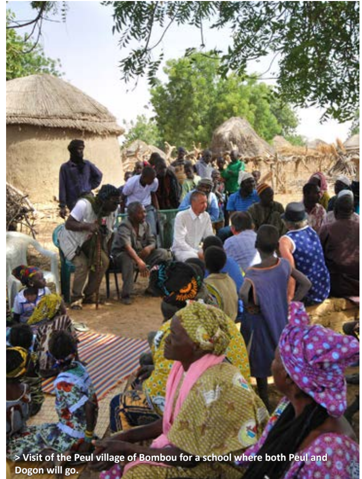
> Visit of the Peul village of Bombou for a school where both Peul and Dogon will go.