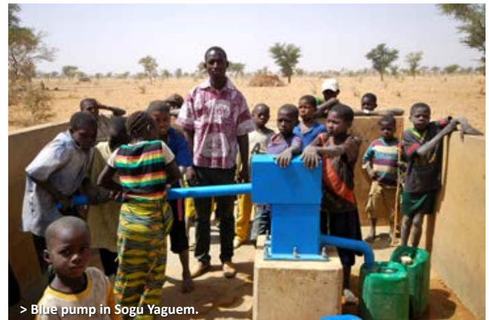
> Blue pump in Sogu Yaguem.