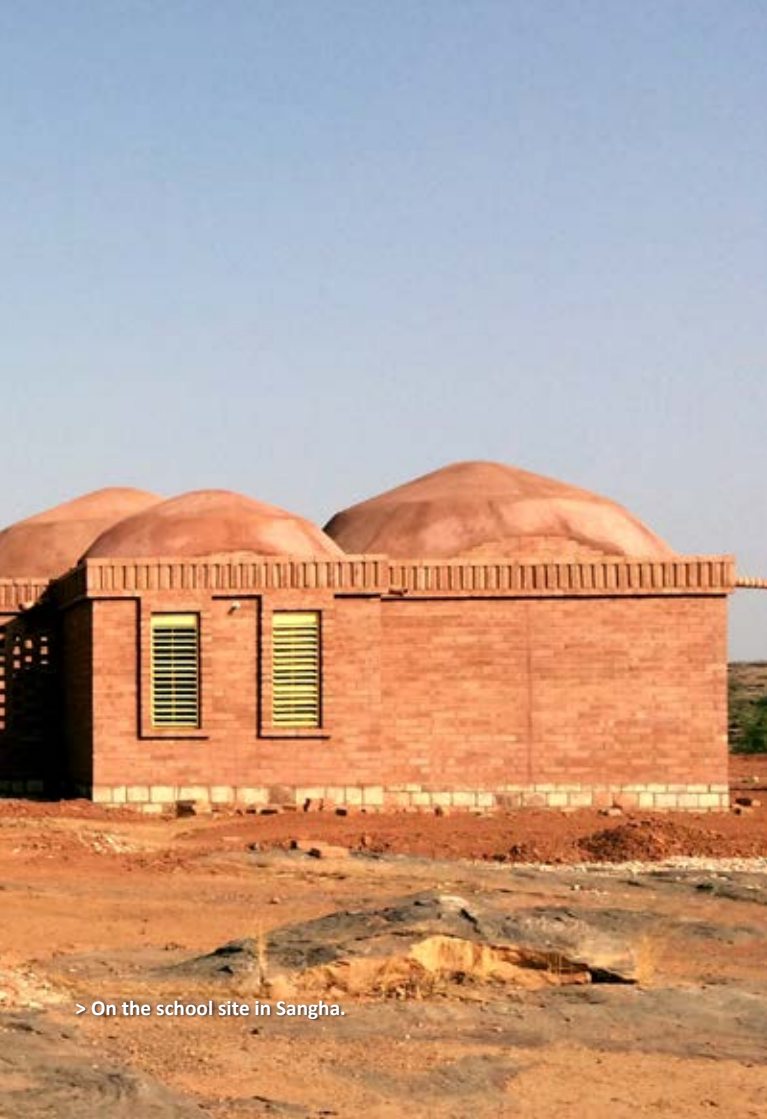
> On the school site in Sangha.

In 2016 too, Foundation Dogon Education (SDO) will continue its work in Dogon country.