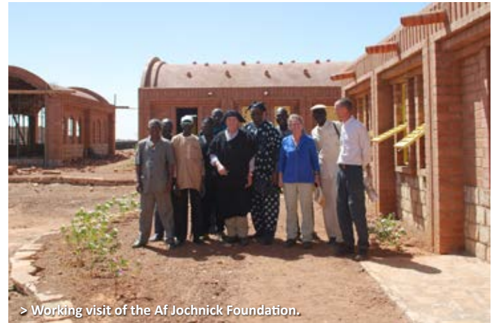
> Working visit of the Af Jochnick Foundation.