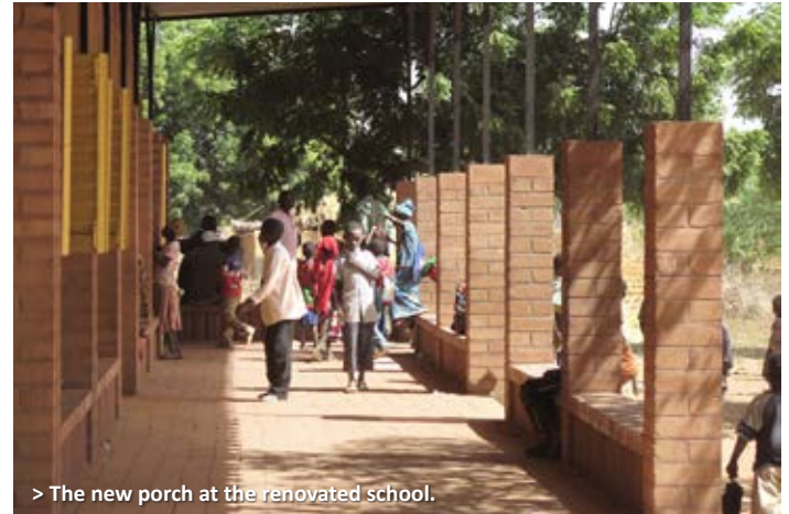
> The new porch at the renovated school.

SDO made the design for the renovation, the extension and has also advised during the construction. The financial contribution was € 52.000,- with a contribution of € 20.000,- from the St. Antonius Foundation.