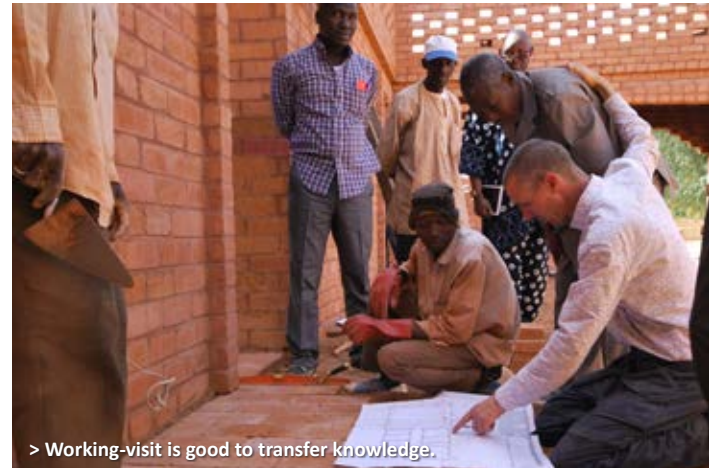
> Working-visit is good to transfer knowledge.

The ultimate goal is to reinforce the local community and the local initiatives developed by them!