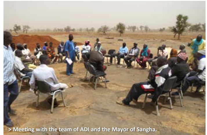
> Meeting with the team of ADI and the Mayor of Sangha.