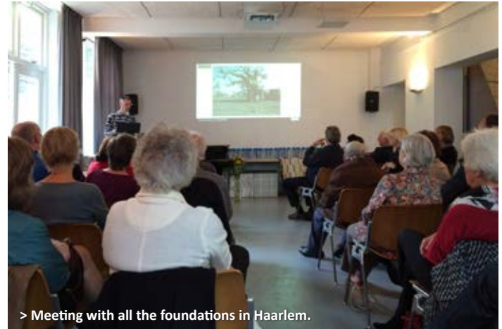
> Meeting with all the foundations in Haarlem.

On the 4th October we celebrated our 20th anniversary in the ABC Architecture Centre in Haarlem with the exhibition “ Two worlds, one idea ”. In this exhibition LEVS architecten reflects their work in the Netherlands and in Mali. The brand-new stone press machine, which produces the stones in Mali for the many construction projects which ADI implements there, was demonstrated. During the presentation our work and working method were presented, among other things with the metaphor of the Baobab. The branches symbolize the several initiatives which are active within the Association Dogon Initiative (ADI). The trunk keeps everything together, but is not possible without a strong root system symbolized by the foundations in Europe. They feed and anchor the tree so that it can grow and thrive.